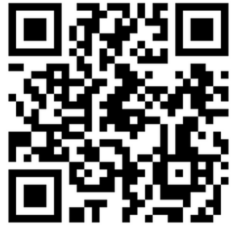
QR Code to OSRP Survey