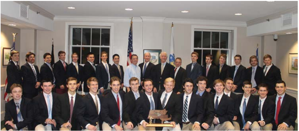
Board of Selectmen honoring the 2014-2015 Championship Lacrosse Team