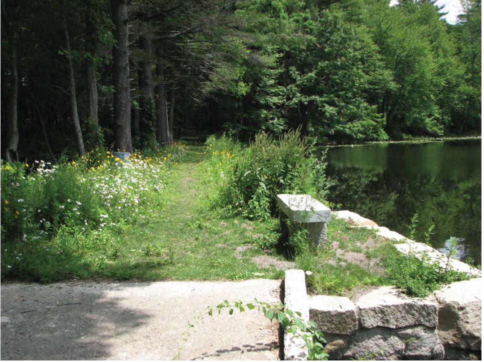
Danielson Pond Conservation Land