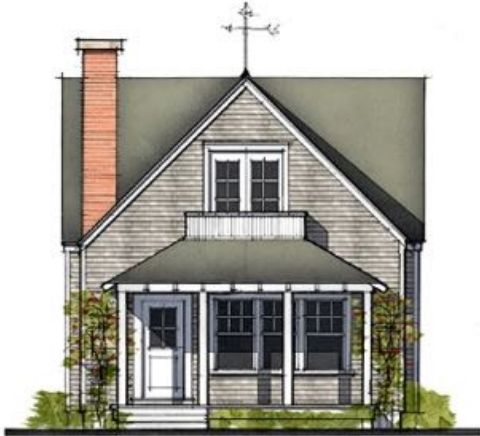
3 BEDROOM COTTAGE