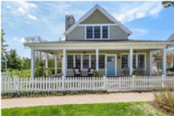
14 Morning Stroll