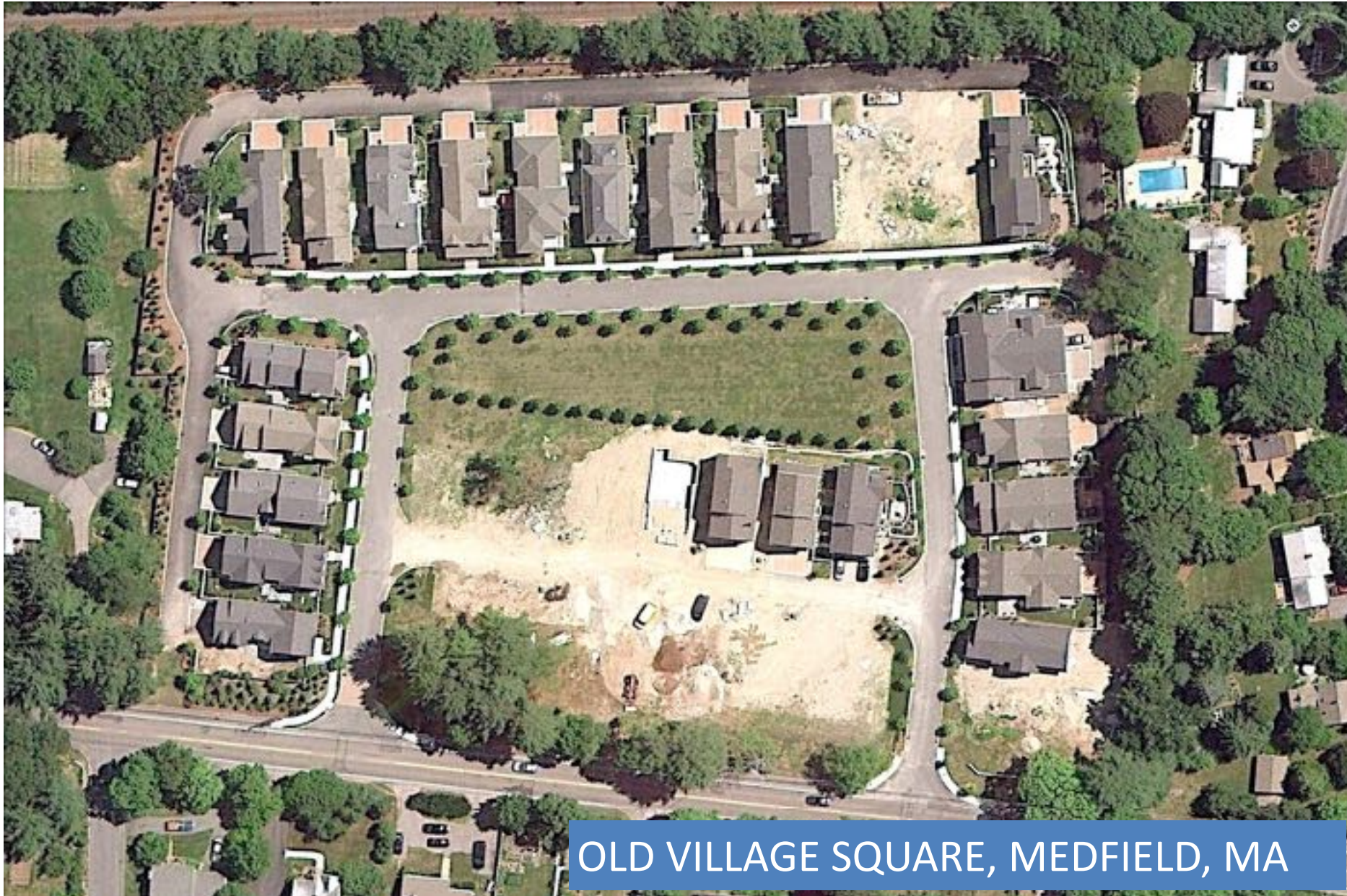
OLD VILLAGE SQUARE, MEDFIELD, MA

42 detached condominium homes on 6.85 acres in near downtown Medfield