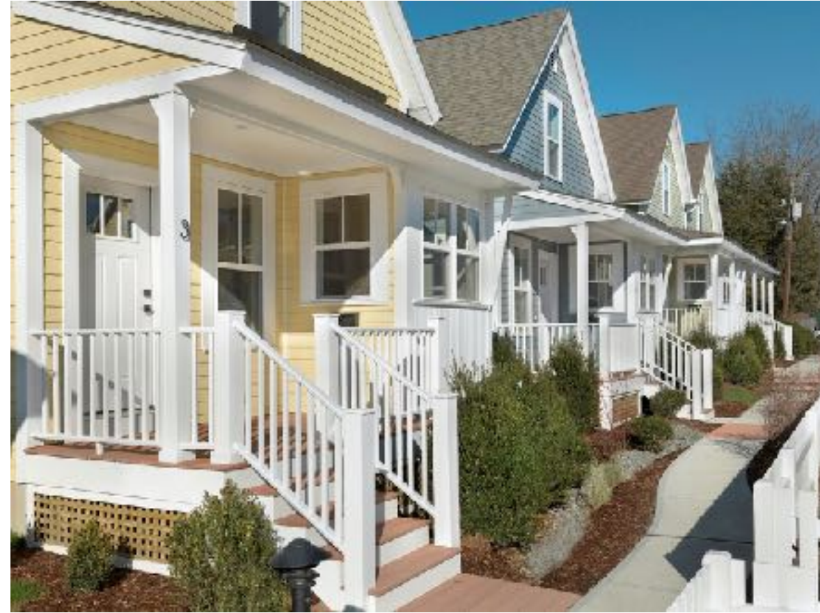
COTTAGES ON GREEN – E. GREENWICH RI