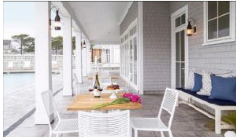
Community Clubhouse and Pool