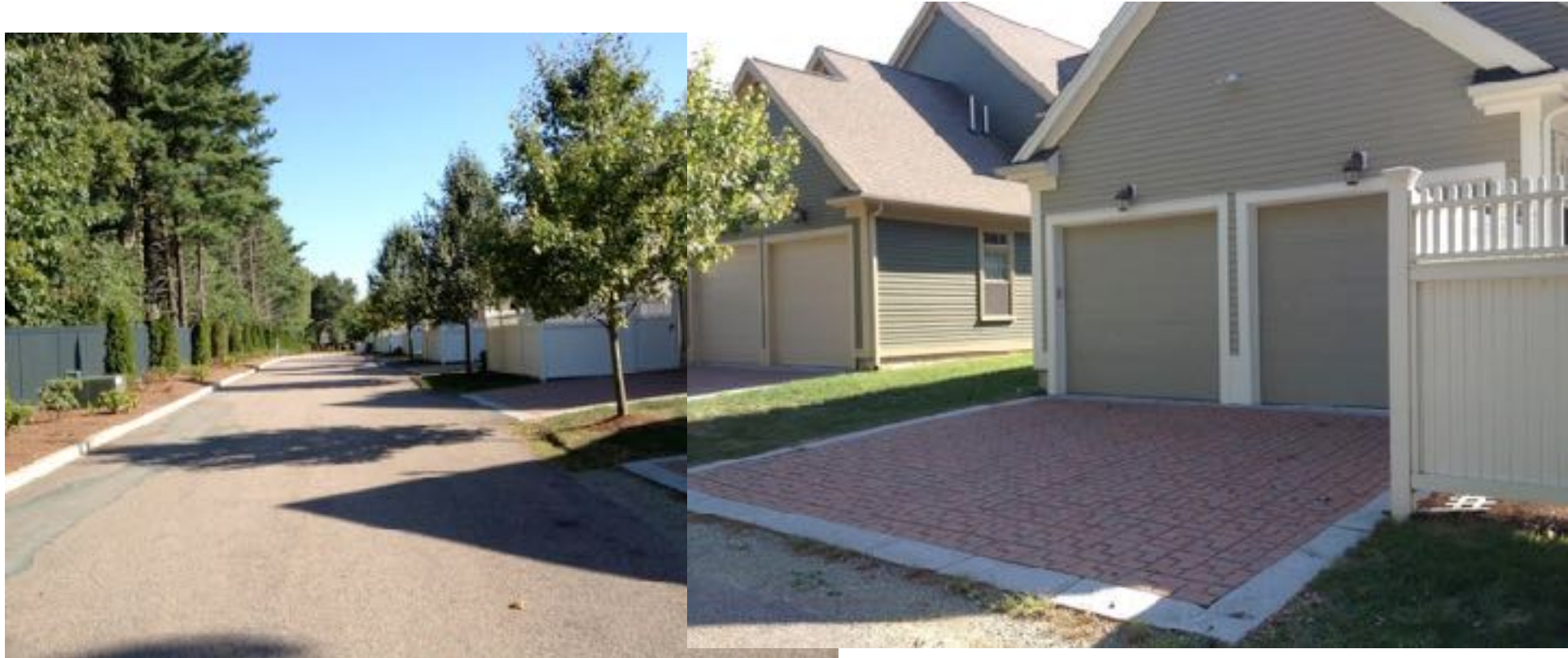
Rear Garages and Alley