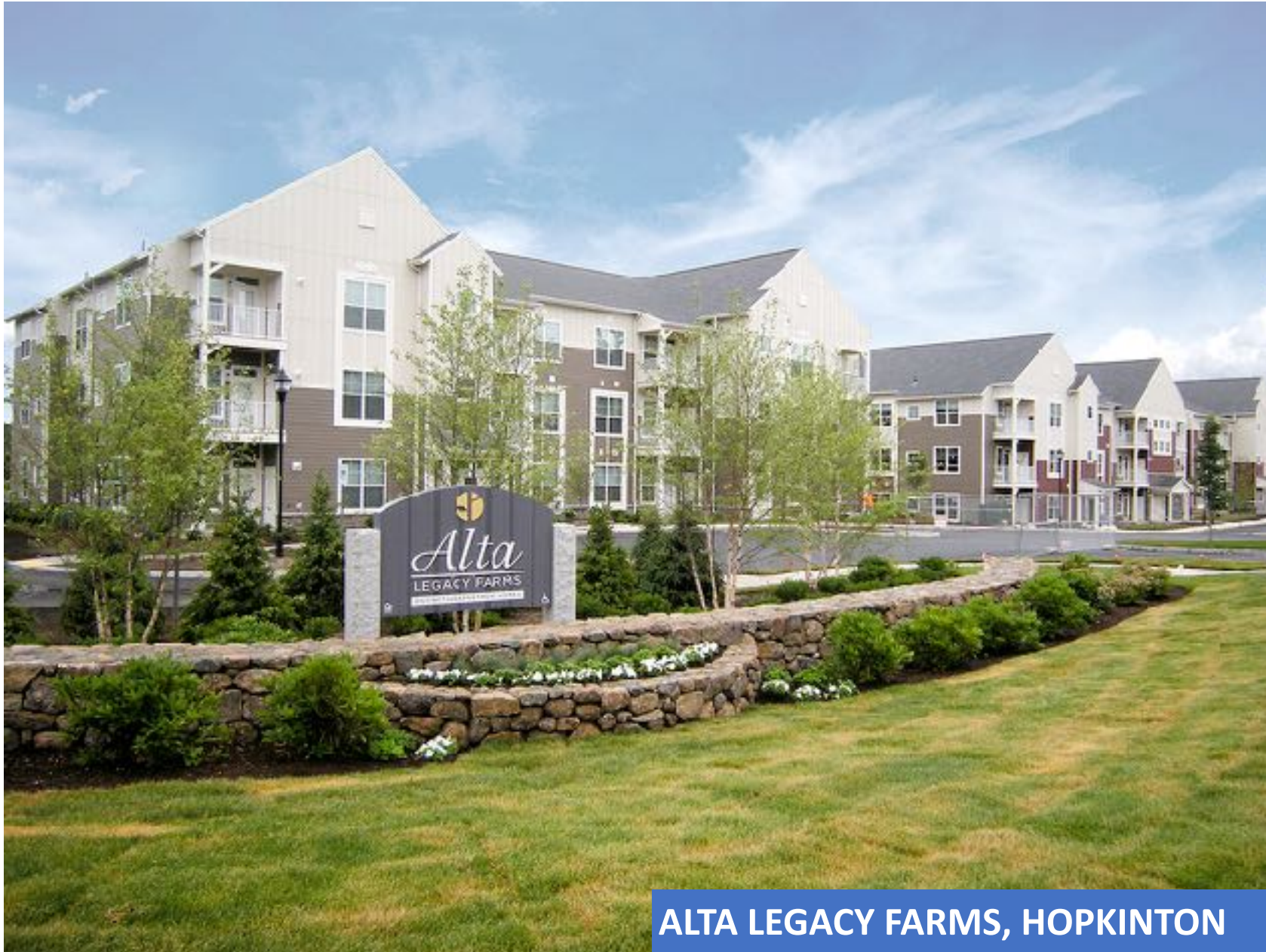
ALTA LEGACY FARMS, HOPKINTON