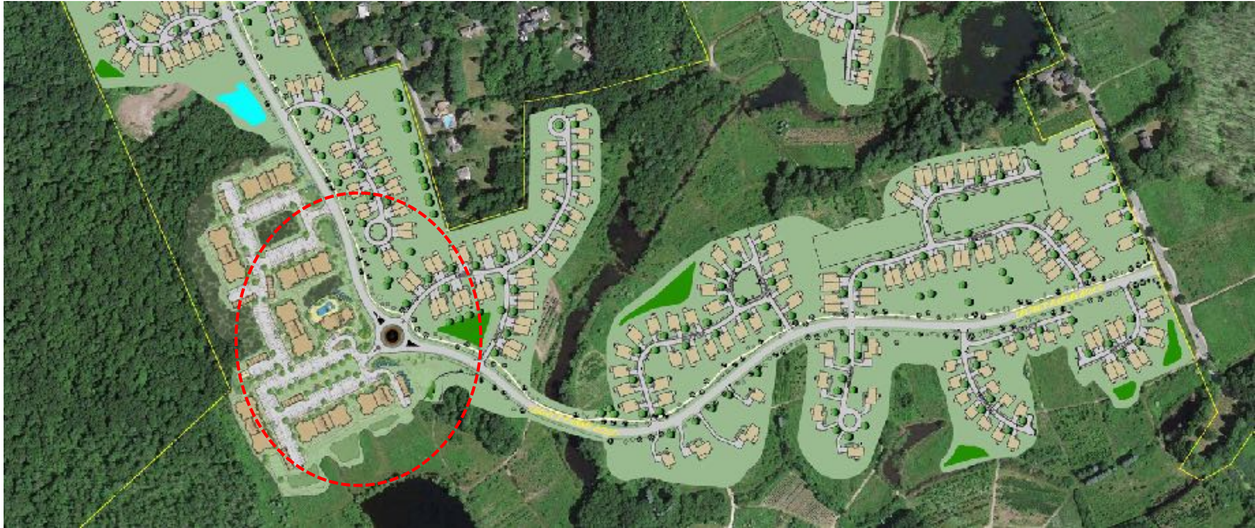
ALTA LEGACY FARMS, HOPKINTON