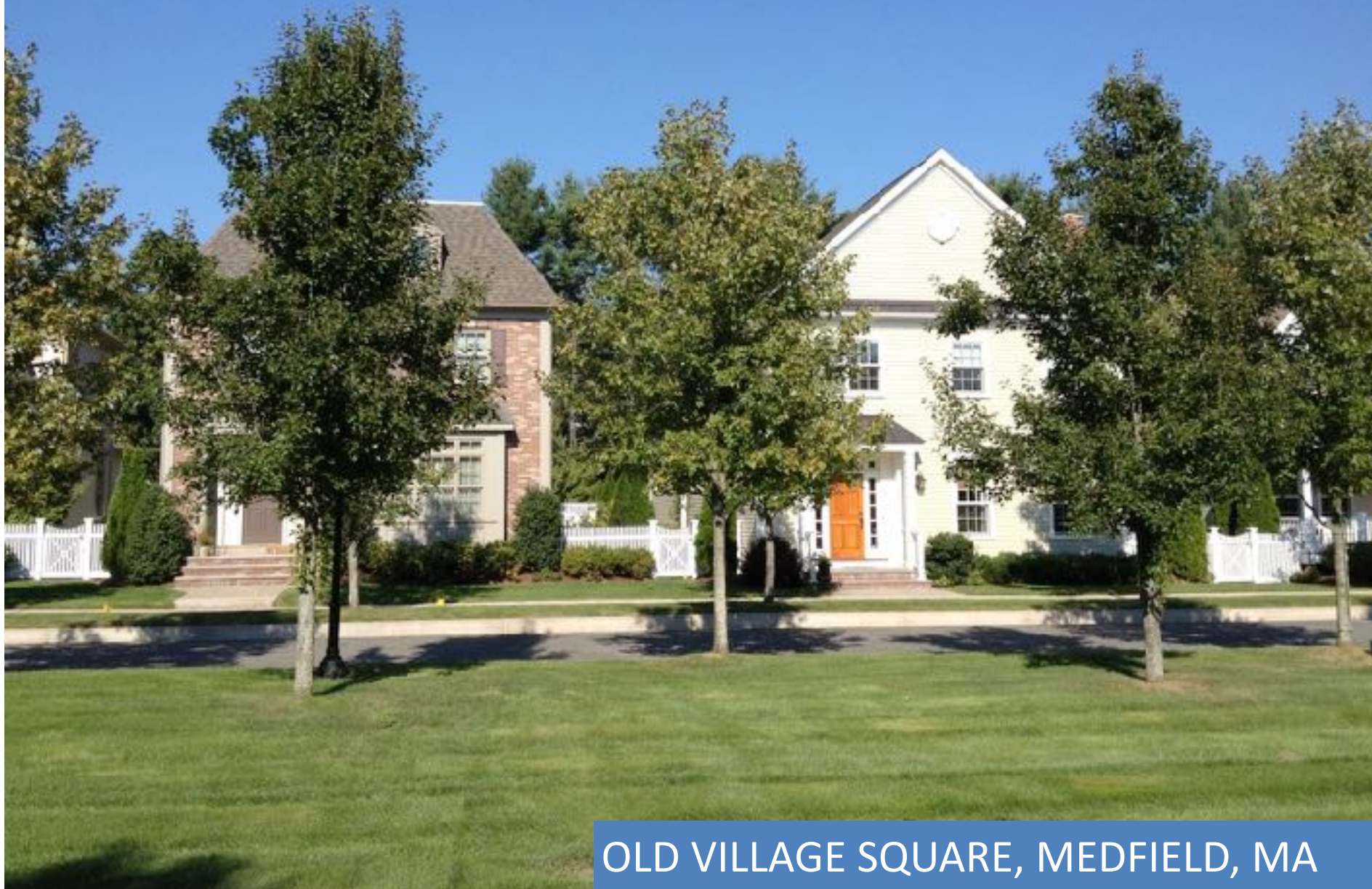
OLD VILLAGE SQUARE, MEDFIELD, MA