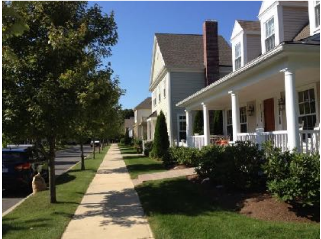
Large Green, Street Trees, Sidewalks, Front Porches, Traditional Architecture