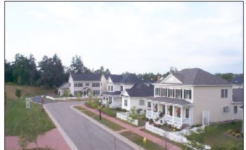
FOUNDERS GREEN, PITTSFORD, NY