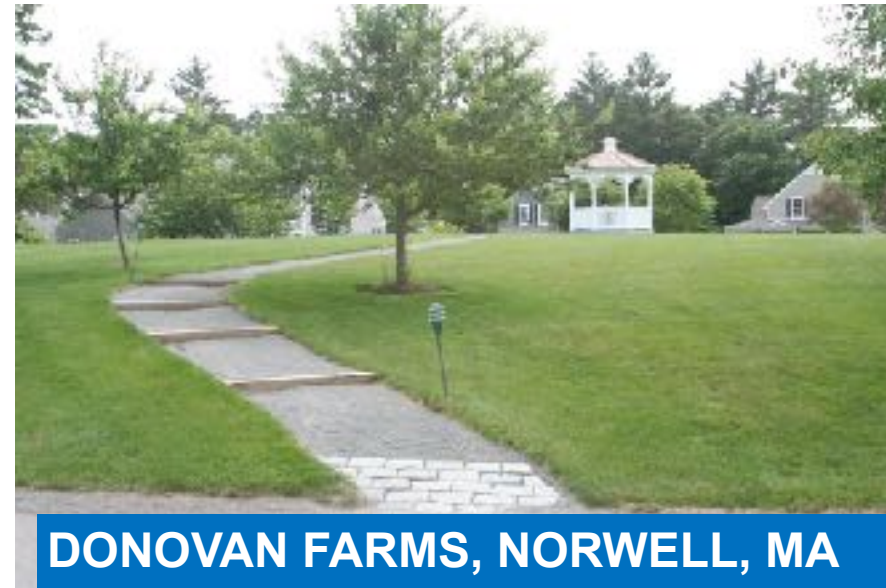
DONOVAN FARMS, NORWELL, MA