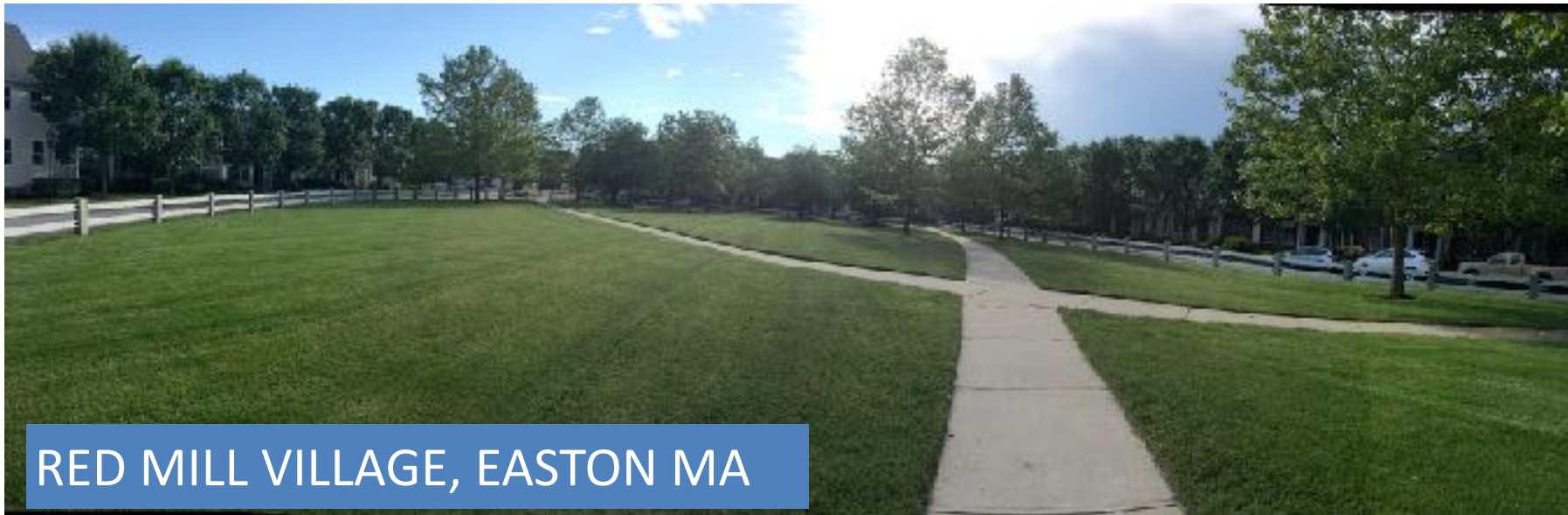
RED MILL VILLAGE, EASTON MA