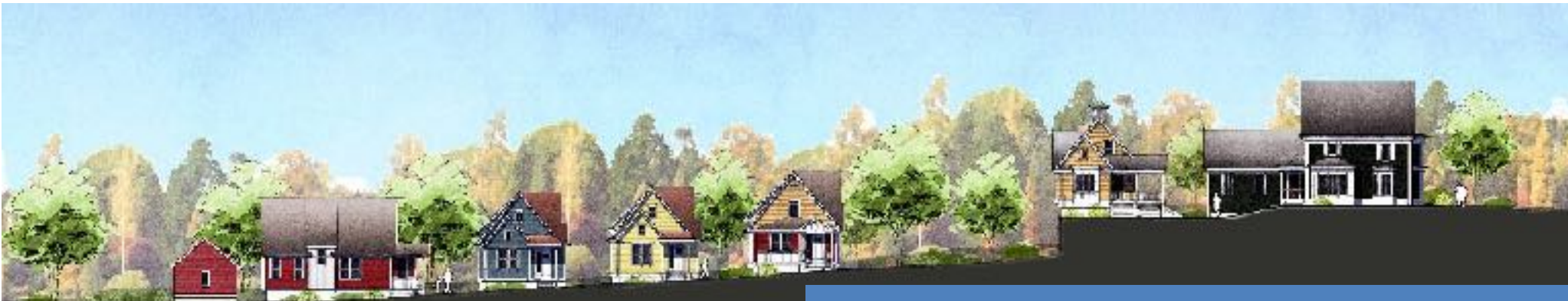
RIVERWALK CC – W. CONCORD, MA