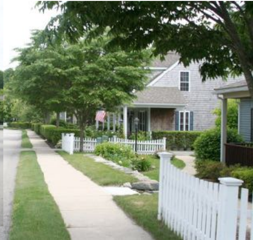
DONOVAN FARMS, NORWELL, MA