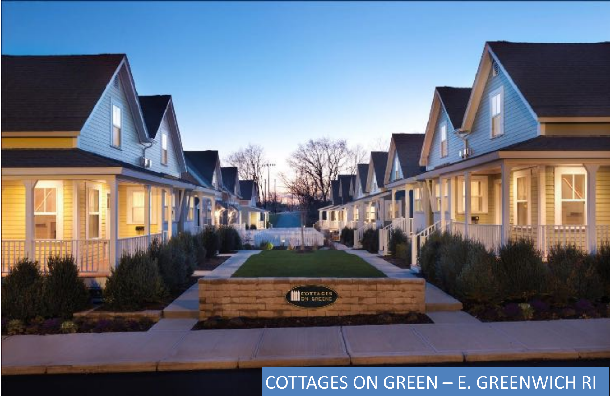
COTTAGES ON GREEN – E. GREENWICH RI