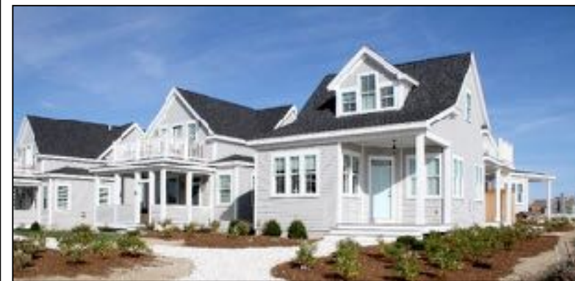
Variety of open spaces layer from Public to Private Realm