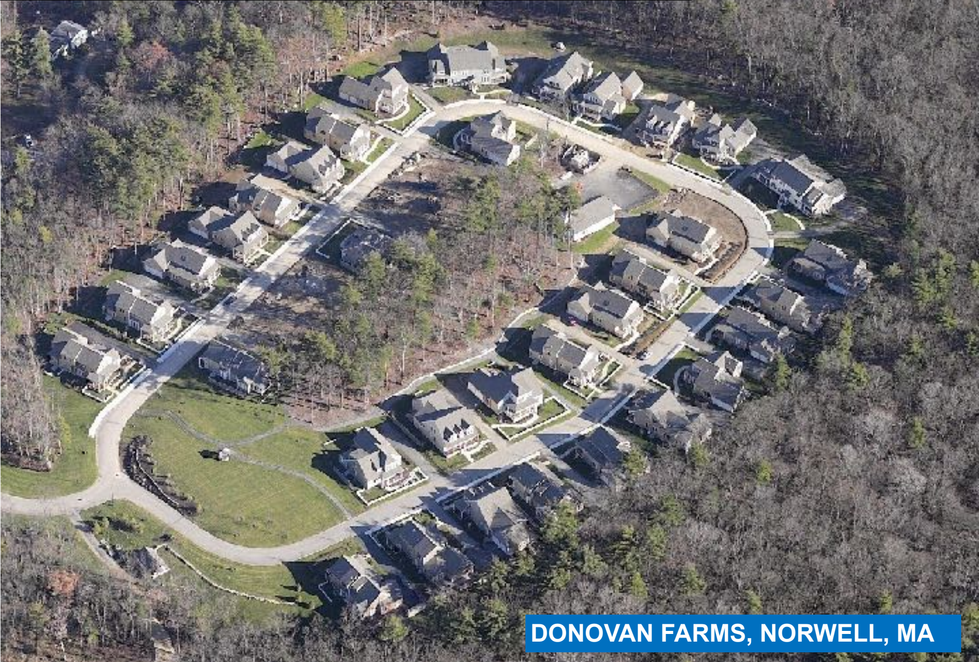
DONOVAN FARMS, NORWELL, MA