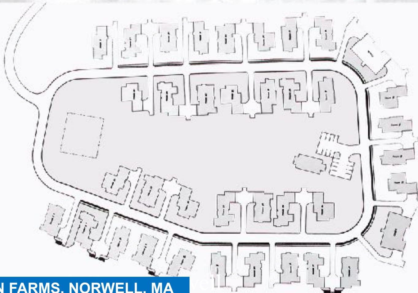
DONOVAN FARMS, NORWELL, MA