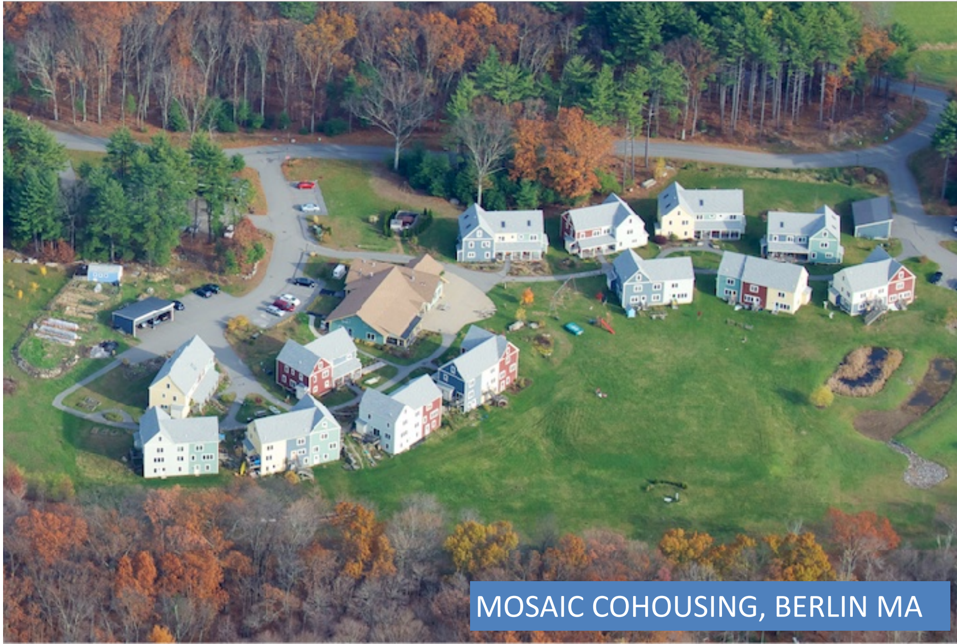
MOSAIC COHOUSING, BERLIN MA