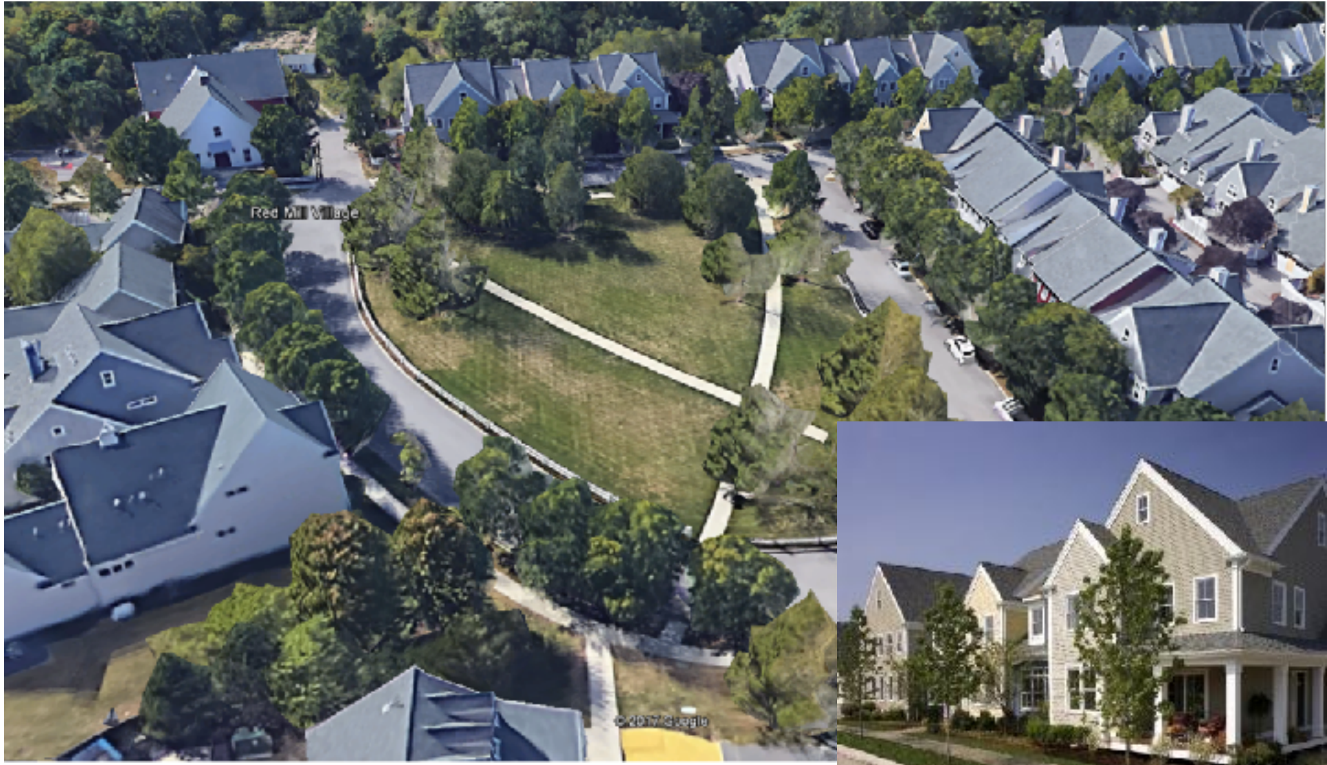
RED MILL VILLAGE, EASTON MA