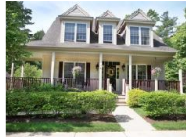
DONOVAN FARMS, NORWELL, MA