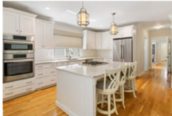
8 Shutter Latch