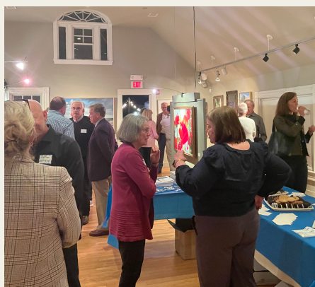
Board and Committee Recognition Night