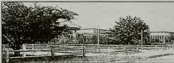
AMOS CLARK KINGSBURY HIGH SCHOOL 2005