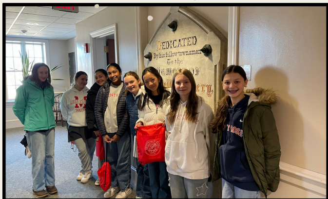
Students from Montrose School dropping off a public service appreciation gift bag for Town Hall staff