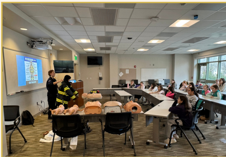
Junior Scouts with Medfield Fire Department